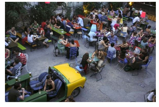
Szimpla Pub

Bars recommended: <a href="http://ruinpubs.com/">http://ruinpubs.com/</a>