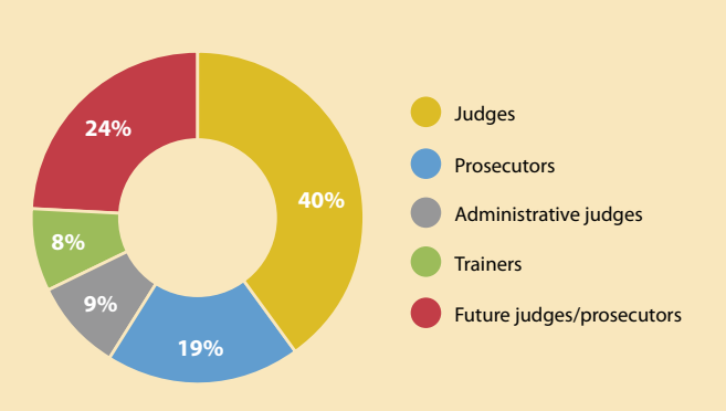
Figure 2: Breakdown of exchanges by categories of participants (in 2011

Judges and prosecutors from across Europe and pertaining to all levels and types of jurisdictions (including criminal, civil and administrative) directly benefit from the project by participating in a judicial exchange. Since 2010, the Exchange Programme contains a specific initial training scheme, which allows future judges and prosecutors from 14 European states to participate in judicial exchanges.